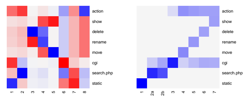
Fig. 3: Visualization of bases for PCA (left) and NMF (right) on the artificial dataset. Colors signify the intensity of the entry ranging from -1 (red) to 1 (blue).

Due to this superior performance, we restrict our analysis to base directions determined using the NMF algorithm in the following. Communication templates resulting from the NMF matrix in Figure 3 are presented in Table 1. The templates accurately capture the semantics implemented in the example application. A set of 7 templates is constructed which covers static access of web content,